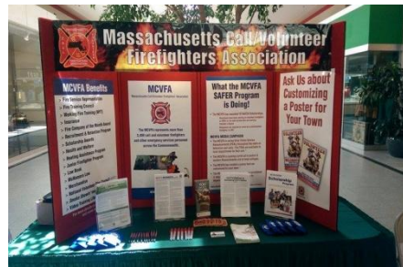
Recruitment and Retention